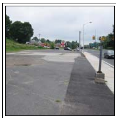
Former Mobil Service Station