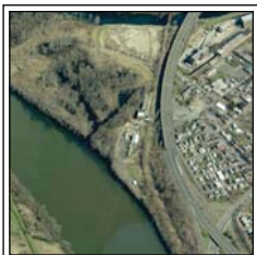
Delta Park and former Hampden Steam Plant